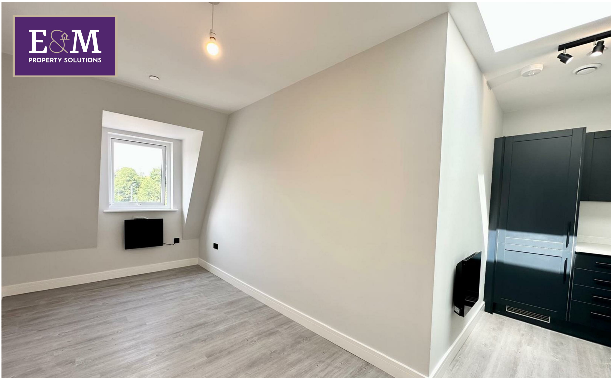
Flat 9, 48-50 Sheffield Road, Barnsley, S70 1HS £695 Per month